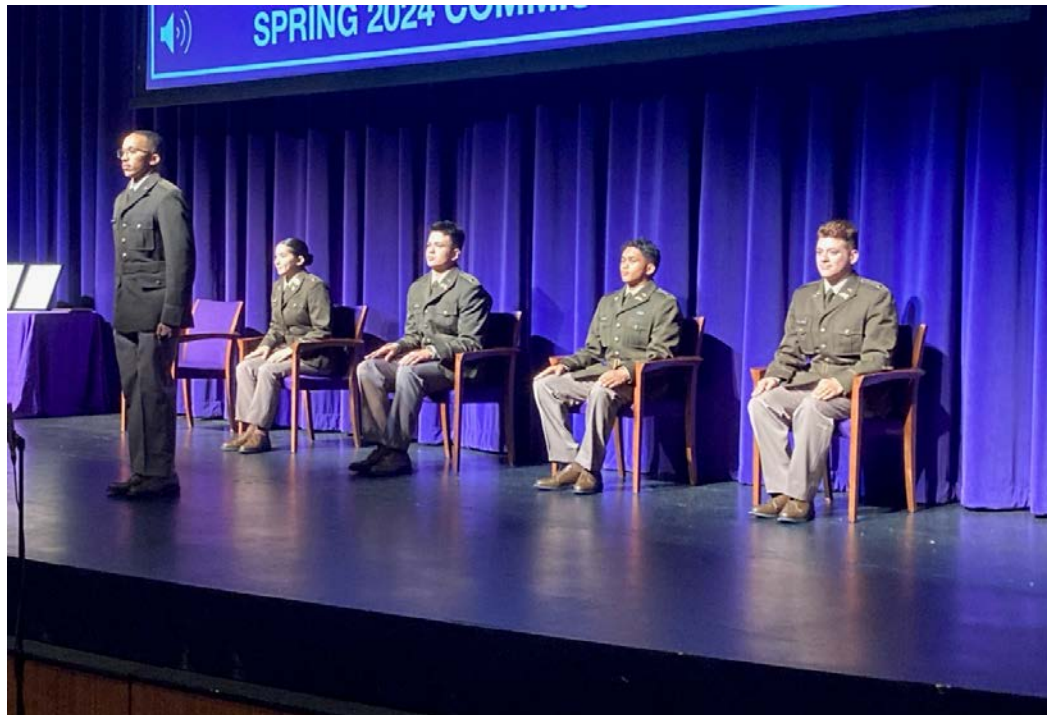
(Above) University of Mary Hardin Baylor Commissioned 5 new Lieutenants on May 3, 2024.