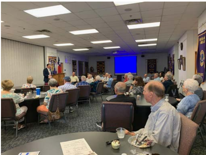
(Above and Right). Typical meeting attendance and fellowship! It was a GREAT meeting!