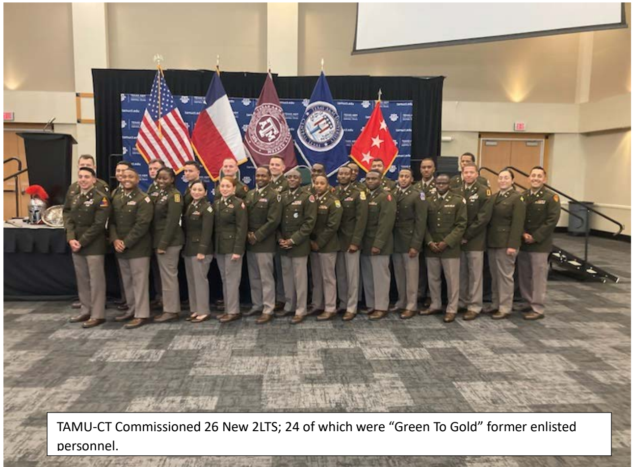
TAMU-CT Commissioned 26 New 2LTs; 24 of which were "Green To Gold" former enlisted personnel.